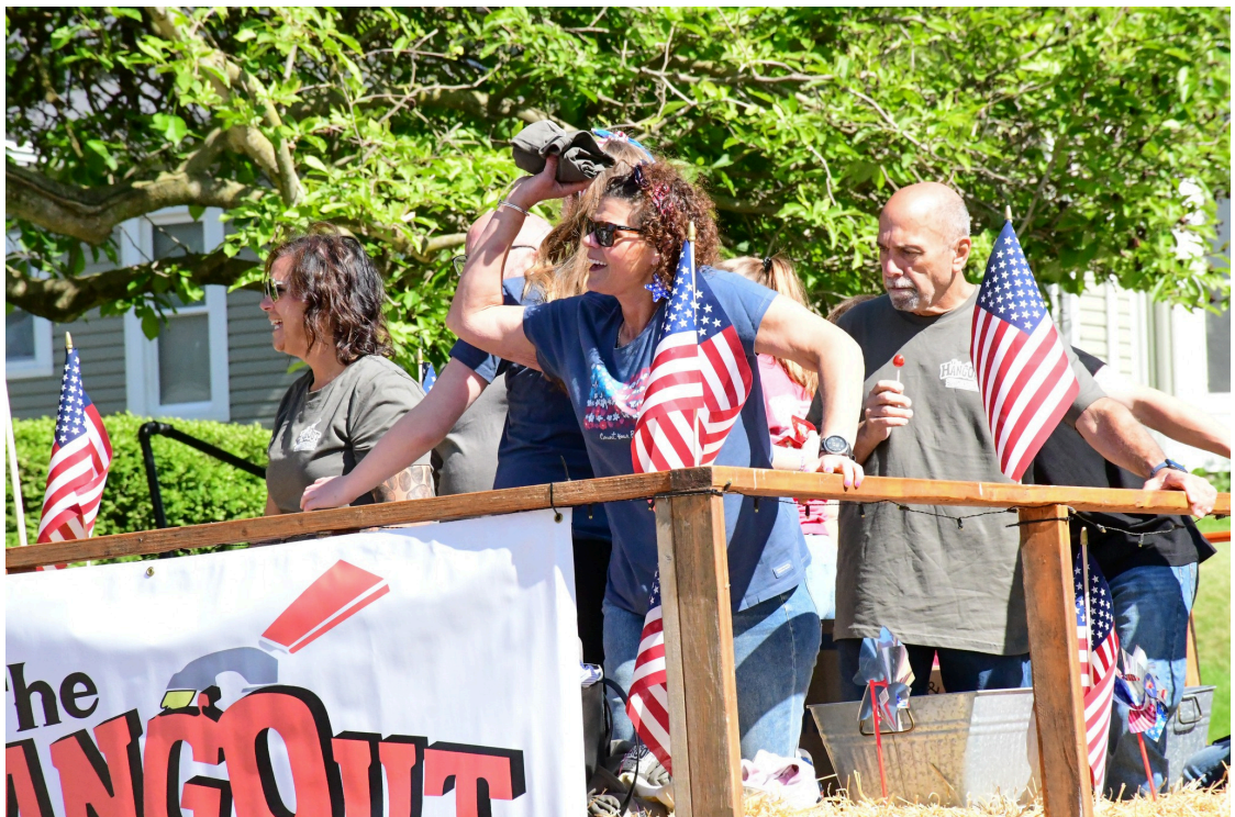
Photo Credit: Knox Photos By Kristi Thomas Follow her on Facebook for 200 more Memorial Day Parade photos!